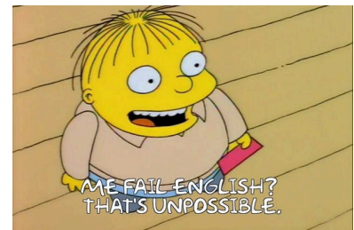
Figure 3: Ralph, a character from the once-popular animated television series, the Simpsons , famously defied morphological constraints.